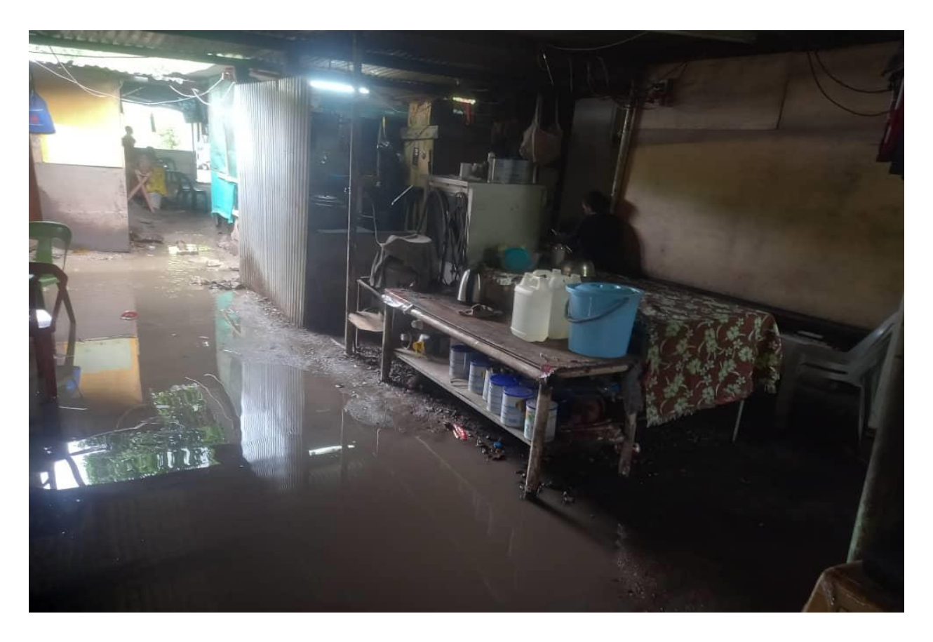
Figure 1: Photo showing the bed and living area of some of the refugee families being inundated with rain and flood waters.

Furthermore, safety and security of the refugees are always at stake because illegal and irregular dwellings are a high-risk place to live in, in PNG. For refugee women and girls there is constant risk of harassment, intimidation, assault and violence, or even serious crimes like rape. Elderly people and young children fall victims to thugs and pickpockets on their way to the camps from stores or marketplaces. There is also no proper fencing around these camps to protect them from potential attacks from outsiders. With the makeshift homes, security and safety of the children and women is constantly at stake. On top of that, there is also limited lighting in the nights for all the houses. This is a huge risk for women and girls at night when going out of the house to use the pit toilets or to take a shower.