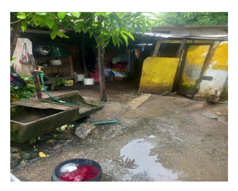
Figure 3: Photos showing the only water tap that is used by 21 families for cooking, laundry, shower, and doing dishes. Hohola 1, informal refugee camp.

Water is essential to life, health and dignity and access to it is a basic human right. All refugees should have assured access to adequate water of good quality, to sanitation facilities, and hygiene promotion practices<sup>6</sup>. To apply this in the context of these refugees is going to be a mismatch. Water shortage and lack of good quality water are a common problem in West Papua refugee camps. While camps like Rainbow, Hohola 1 and Waigani had to contribute to pay for the water bills every month, other smaller camps like Tete and Red Hills have to pay fifty toea (AU$0.21) to fetch a bucket of water. Port Moresby is known for experiencing dry seasons, which have drastic consequences on people like the refugees who live at the peripheries of the city without proper water supply. It costs three hundred Kina (AU$123) to refill a 5000 liters water tank during dry seasons, which can barely last for one week if used for cooking and drinking. Most times when they could not afford to pay for the water, some of them have to walk for 20 minutes to Rainbow camp, which is the nearest camp to fetch water. Some refugees at Red Hills would even take the risk to illegally fetch water at the University of Papua New Guinea campus which is about two kilometers of walk away from the camp. The lack of water supply presents great challenges for women and children, not only because they need water to wash and maintain their hygiene, but because they are mostly the ones who walk the distances