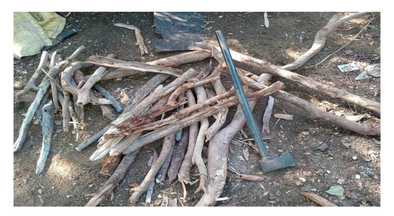
Figure 5: Photo showing firewood being chopped and prepared to be put on the roadside for sale.

While informal sector is the handy way to make a living, it also involves a number of challenges. Unfortunately, it is the refugee women who pay the most price, spending most of their time out in the streets trying to sell something. For a West Papuan woman, it is not only the competition for customers or the rush to sell their products before it is getting late but also the competition for market spots. During the survey, a West Papuan woman said there are always arguments among themselves and other women in securing tables or spaces to do their sales in the markets, which makes it difficult for them to make good sales. Besides that, rainy weather and police surveillances also pose serious challenges for the women in making a good sale. On many occasions West Papuan mothers have been chased by police, their products confiscated or destroyed by the police, a fate that they share with other local vendors in the informal sector. At other times, when it is not the police, opportunists and street thugs who are most of the times under influence of alcohol would harass the women and steal from them. There is zero chance of recovering the items or the cost when things are lost through such behaviors.