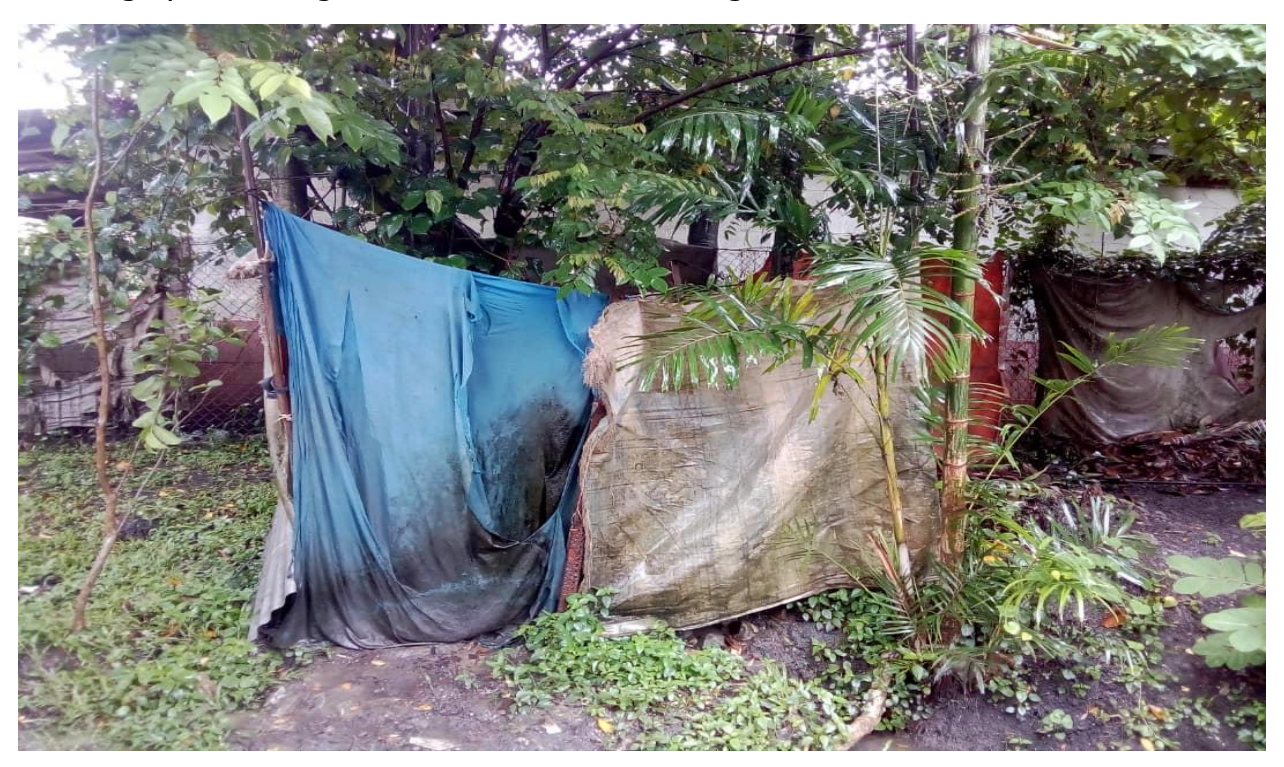
Figure 4: Photo showing a makeshift shower built outdoor in one of the refugee camps.

participants indicated to have fair to poor medical condition, while at the top only 5% indicated to have excellent medical conditions. In the survey, all except for two small camps indicated that they are at very high risk of becoming ill because of the condition of their homes. Note that these responses were only from those adult participants of the survey and does not imply the overall health conditions of other age groups. Specialized health or secondary health care are the most unaffordable due largely to the high cost involved in accessing such medical services.