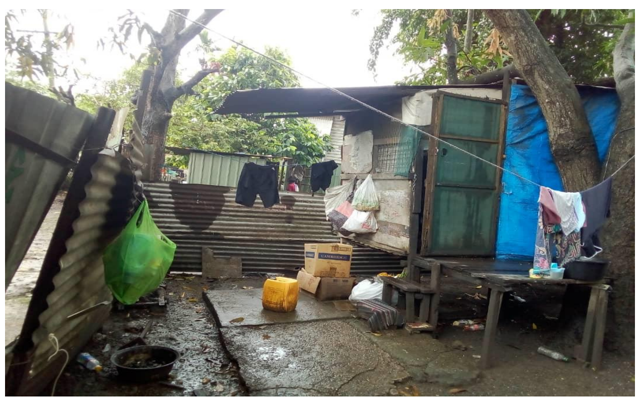
Figure 2: Photo showing a house belonging to a West Papuan refugee in Port Moresby