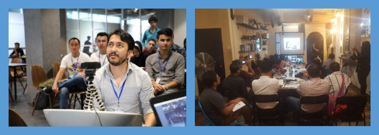
Photos: Feeding back next steps and ideas from Indonesia (left) and Malaysia (right) hubs.