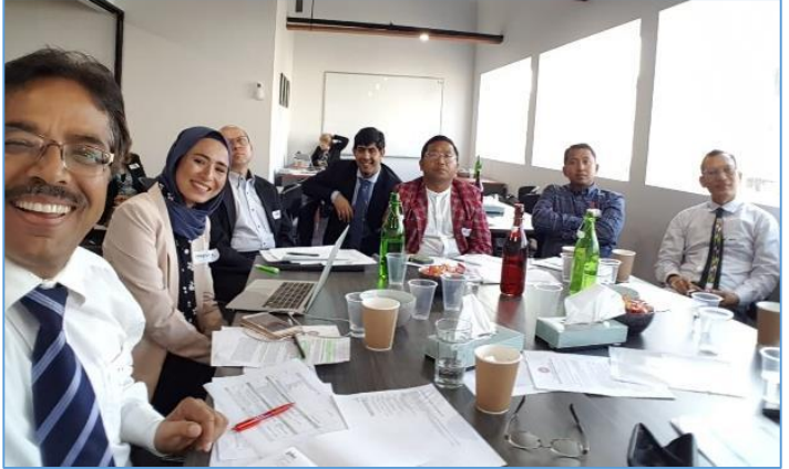
Photos: Indonesia hub (top left), Bangkok hub (top right) and Australia hub (left) workshops underway.